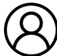
Representative from the public financial and advisory services TBC